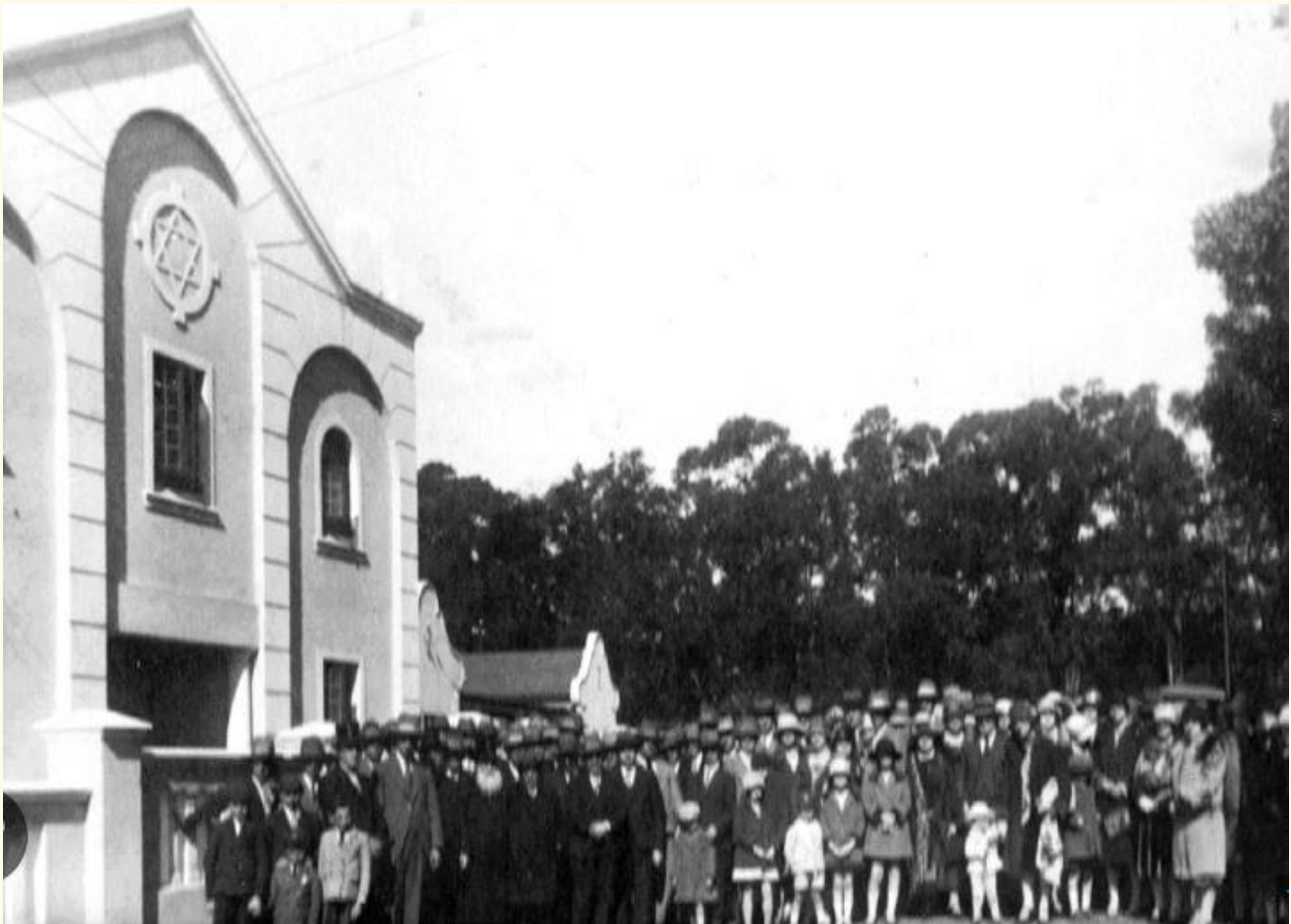
The Opening of the Shul in 1927

The children in the community attended the local Primary Schools and on completion, went to either the neighbouring town, Bellville, or to Cape Town to complete High School. This was not an easy arrangement since daily transport to the big city needed to be provided.