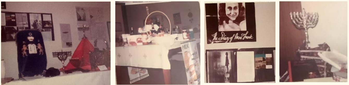
Items on display: Torah, food and wine, history and home-made Judaica

The women of the community were active outside the framework of the shul. They formed the 'Durbanville Women's Society' and were active in fund-raising for Israel. In 1980, they put up a magnificent exhibition of both religious and Israeli items in the local library which lasted 3 days, attracting people from all the neighbouring districts. In addition, the ladies organized 'rummage sales', Candle Light Theatre, 'progressive dinners' and raffle sales.