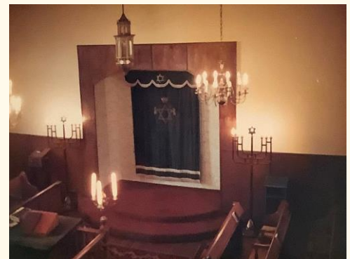
Aharon Kodesh, Neir Tamid hanging over from above and Menoroth